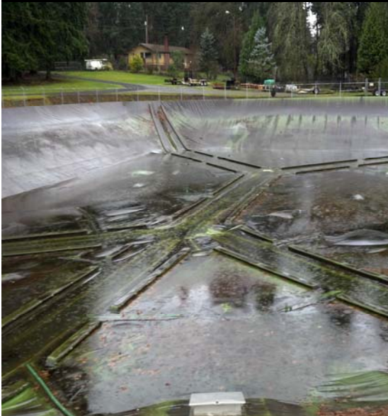
Bolton Reservoir - 100 years old in 2013

This product is for informational purposes and may not have been prepared for, or be suitable for, legal, engineering, or planning purposes. Users of this information should review or consult the primary data and information sources to ascertain the quality of the information.