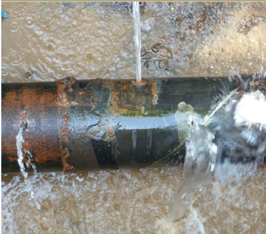
Holes and corrosion in water pipes