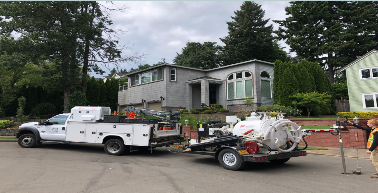
Photo of Specialized equipment used to assist staff in conducting water system valve maintenance.

Water system flushing signs have been placed in areas of West Linn where the The City of West Linn Water Department is actively working on a city wide valve exercising / flushing program. The purpose of this program is to exercise each of the over 4000 water valves in the water system to ensure proper operation. Along with exercising each water valve city crews will also be conducting routine maintenance on fire hydrants within the water system, this work could result in discolored water. If you experience discolored water it is recommended that you flush the cold water side of the sinks, bathtubs or hose bibs on the house to remove any discolored water. Discolored water has no harmful effects and is safe to drink. If you have further questions regarding the City of West Linn's valve maintenance / flushing program please contact Public Works at 503-656-6081.