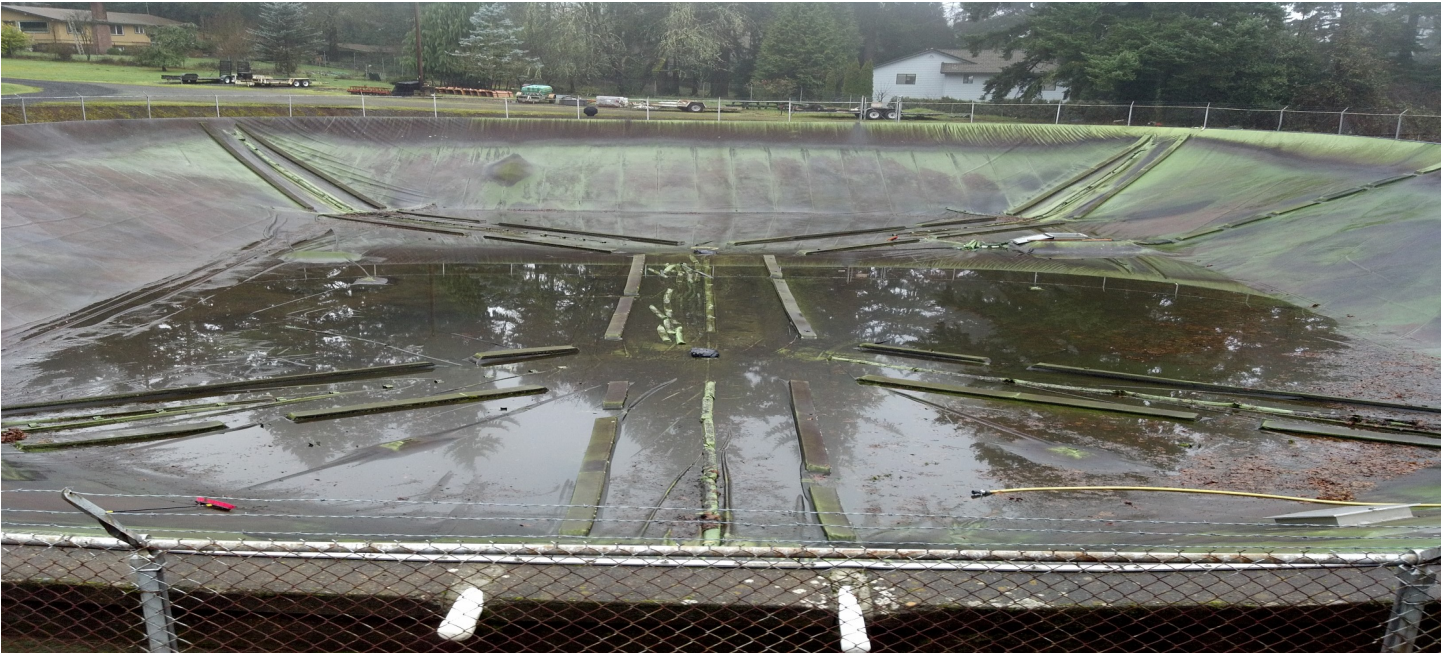
West Linn's Bolton Reservoir before and after pictures. 100 year old 2.5 MG tank pictured above and New 4.0 MG tank pictured below