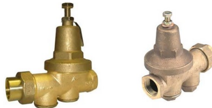
(typical pressure reducing valves)

Property owners within the City of West Linn are responsible for the plumbing and pipes once the water leaves the water meter. The City of West Linn maintains a minimum water pressure of 20 pounds per square inch (PSI). Although most homes throughout the water system receive water at a pressures of 40-80 PSI, some areas do receive water above 80 PSI which would typically require a pressure reducing valve (PRV), these valves are always on the customer side of the water meter and are the property owner's responsibility to maintain.