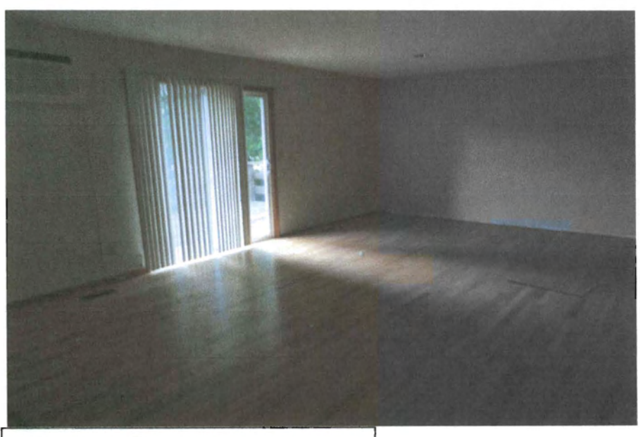
2. Main floor of house.