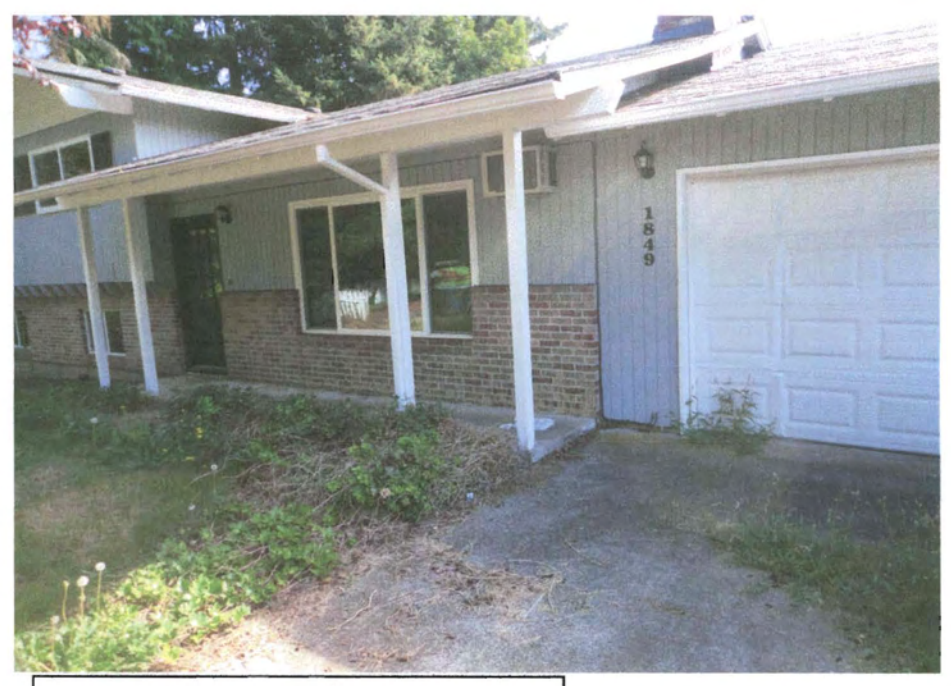
Front view of 1849 13<sup>th</sup> Street, West Linn, Oregon