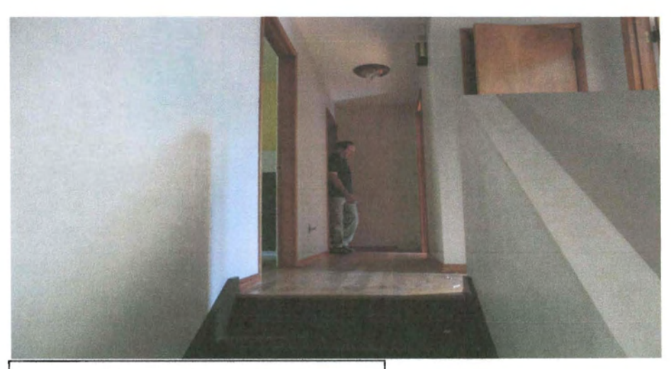
4. View of upper level.