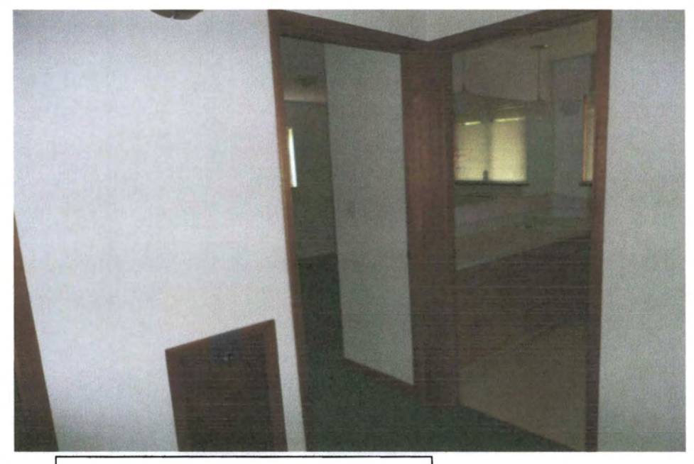
3. Bedroom/restroom area of house.