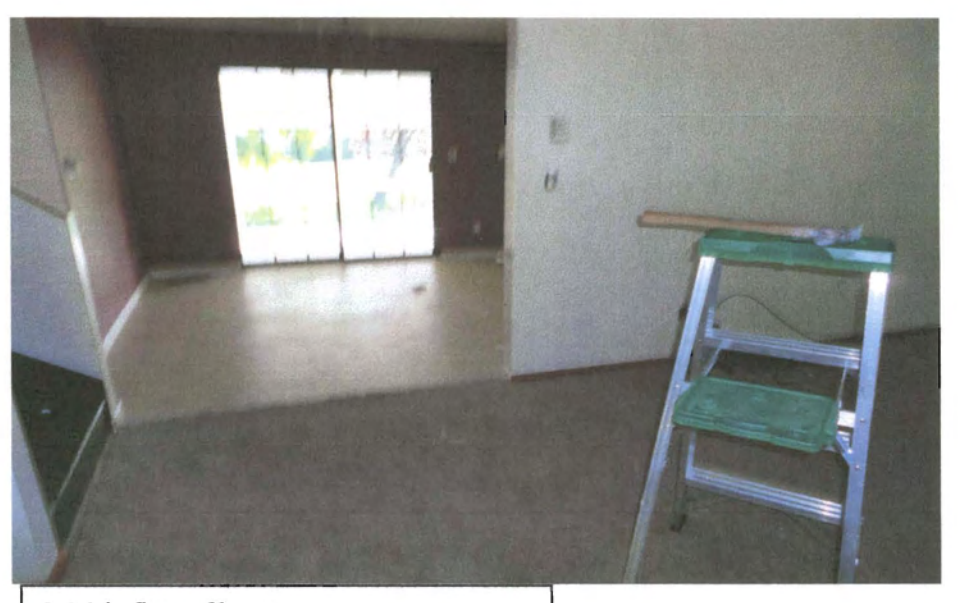
2. Main floor of house.