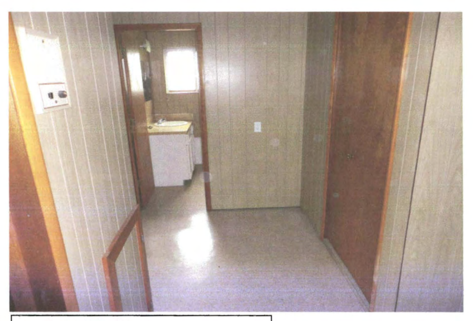
4. Basement area of house.