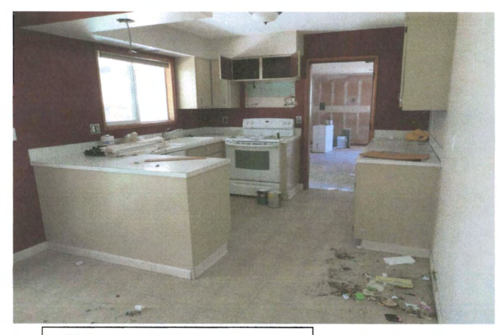
3. Kitchen area of house.