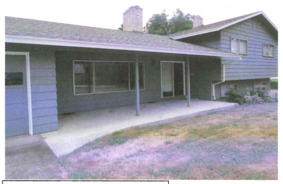
Front view of 1800 8<sup>th</sup> Avenue, West Linn, Oregon