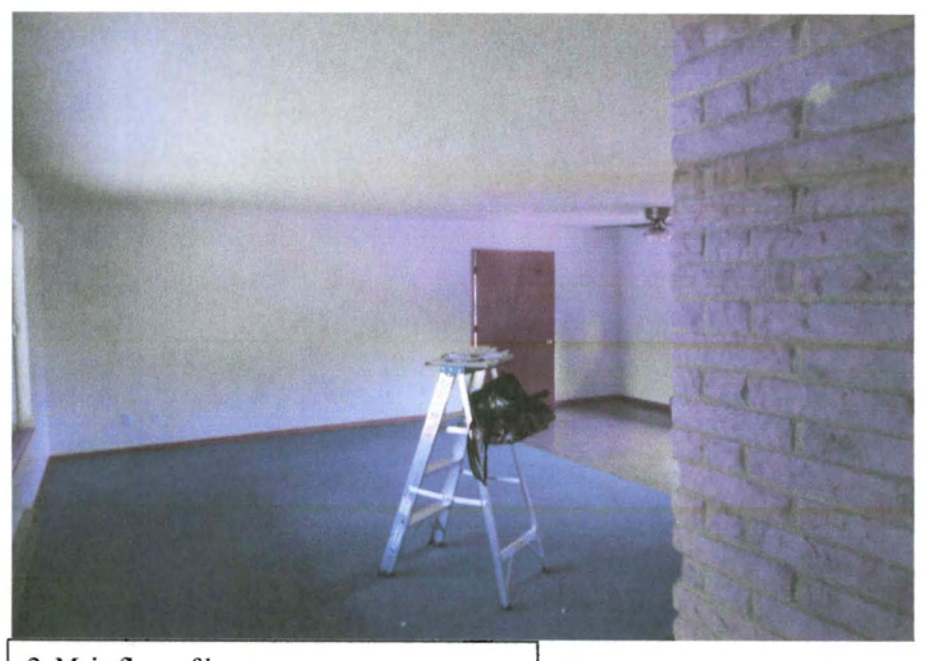
2. Main floor of house.