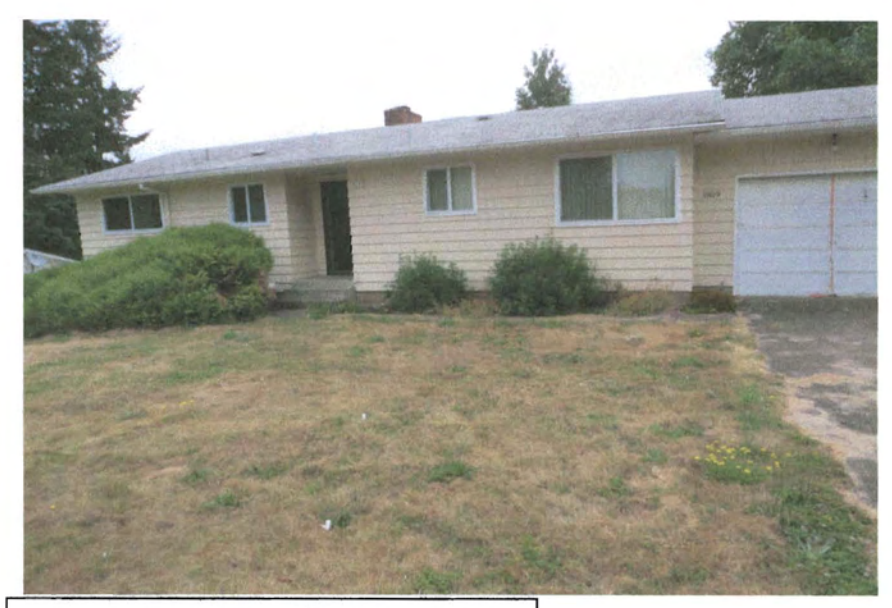
Front view of 1819 13<sup>th</sup> Street, West Linn, Oregon