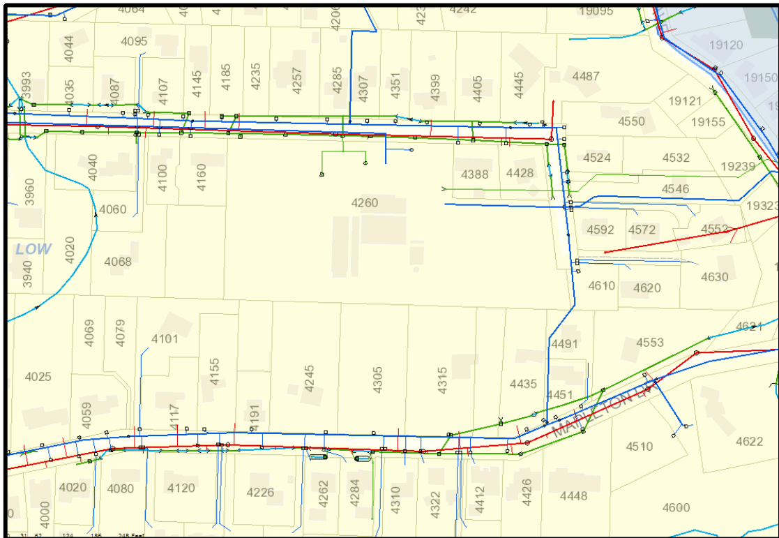
Figure 3 Project Area Utilities