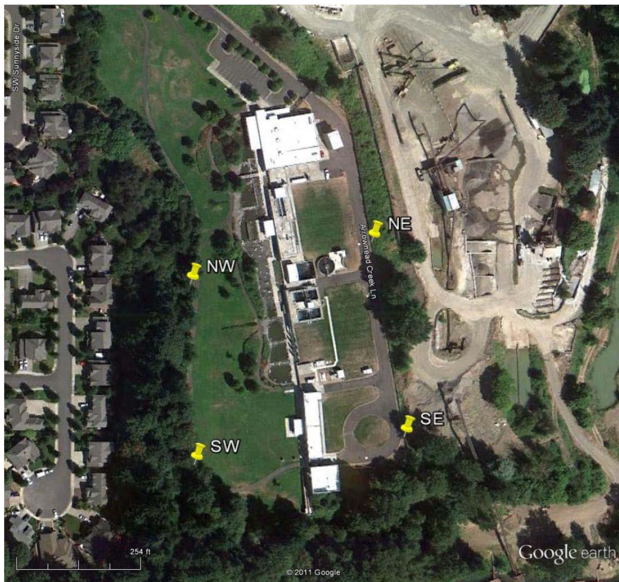
Figure 4. SLM Locations near Willamette River Water Treatment Plant

Similar to the Lake Oswego WTP measurements, ENVIRON used microphones placed approximately 5 feet above ground elevation encased in acoustically neutral weather heads. The sound level meters were manufacturer-certified Type I Larson Davis 820s that were calibrated immediately prior to and following the measurements. Although the meters were unattended for the majority of the measurements, noise sources were noted during the setup and retrieval of the meters. Results of the sound level measurements (SLMs) are discussed later in this report.