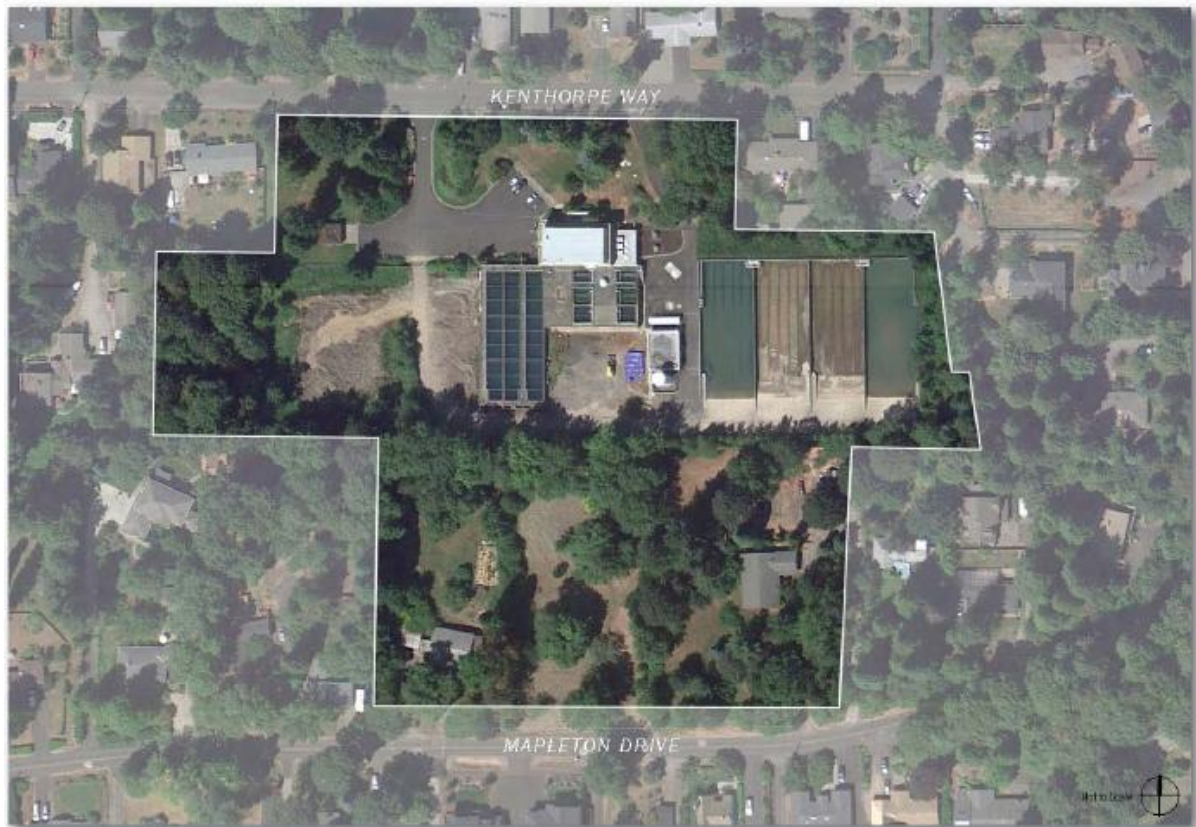
Figure 1. Existing Lake Oswego WTP Layout

The existing and proposed WTP layouts are illustrated in Figure 1 and Figure 2 , respectively.