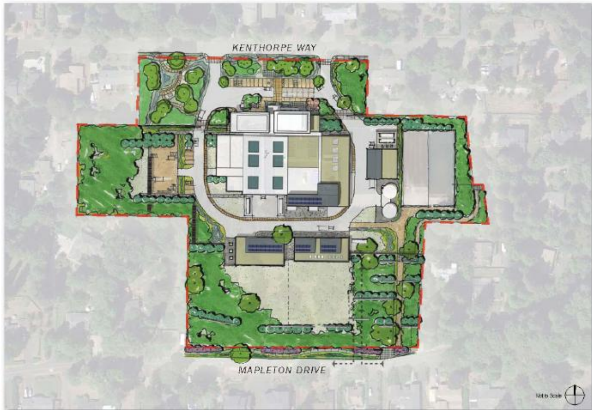
Figure 2. Proposed Lake Oswego/Tigard WTP Layout

The Owner provided information about the existing plant facilities and the proposed facilities as follows.