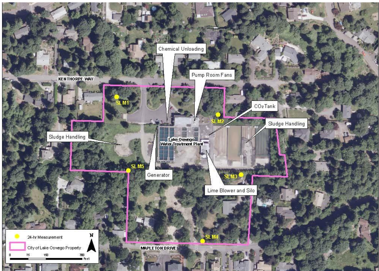
Figure 3. SLM and WTP Equipment/Activity Locations

The sound level measurement (SLM) locations and intermittent operation locations are shown in Figure 3 .