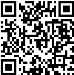
AP-26-01 - Notified Properties within 500 feet of the proposed City Operations Center

Scan this QR Code to go to Project Web Page: