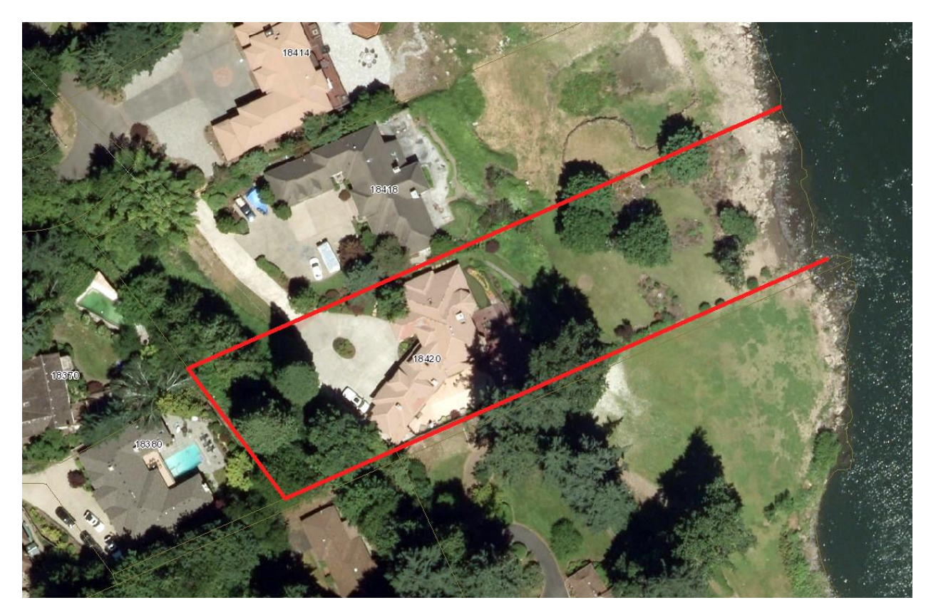
2. HCAs shall be avoided to the greatest degree possible and development activity shall instead be directed to the areas designated "Habitat and Impact Areas Not Designated as HCAs," consistent with subsection (A)(3) of this section.

The aerial photograph of the site shown below demonstrates that the HCA is largely disturbed by landscaping and clearing associated with the home site on the property and provides little in the way of habitat resources.