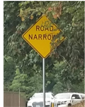
Figure 2: Signing

At locations where development has not occurred, the Weatherhill Road is narrow with unimproved paved surfacing. At locations where development has occurred, half street improvements have been constructed. With the construction of the 12-lot subdivision, half street improvements will be constructed along the sub-division’s Weatherhill Road frontage as shown in Figure 1. This will leave a remnant portion of Weatherhill Road (approximately 50 feet) unimproved between the eastern subdivision boundary and the existing Weatherview Estates subdivision boundary with a cross-section of approximately 20 feet in width that narrows to a pinch point of approximately 16.5 feet at the east end where existing curb and gutter begins 1 . With a City planned final lift of asphalt along Weatherhill Road planned for later this