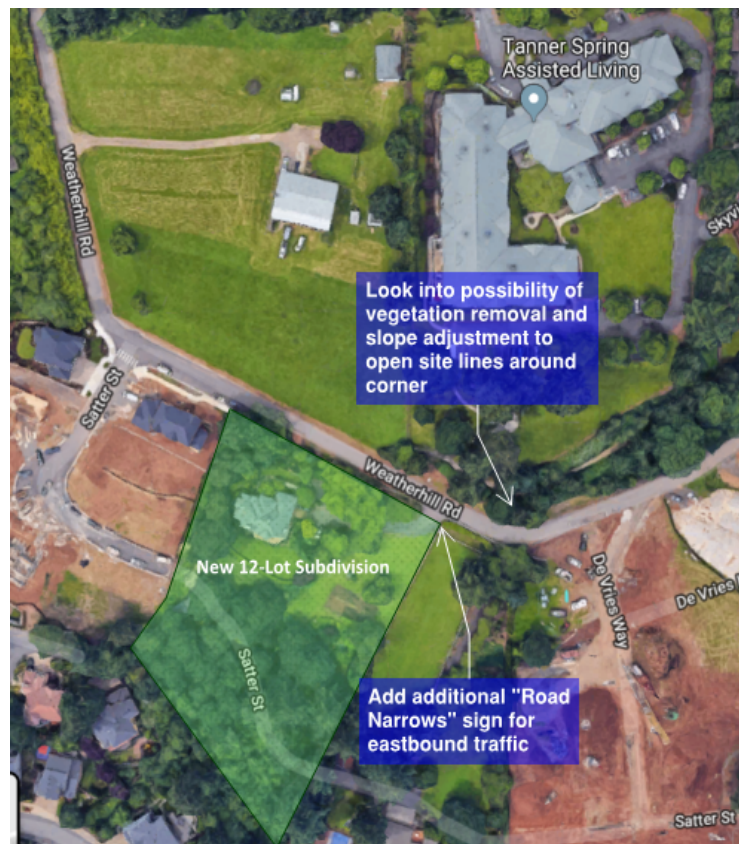
Figure 3: Recommended Safety Improvements

With the planned development and recommended supplemental traffic elements, Weatherhill Road will continue to operate as a residential street, similar to today.