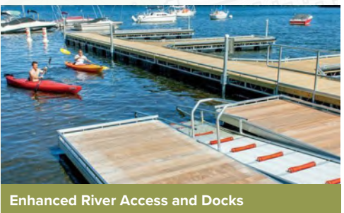
Enhanced River Access and Docks