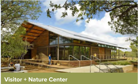
Visitor + Nature Center