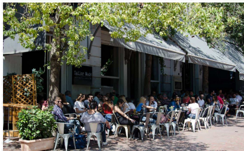
"Main Street" with Street Facing Retail