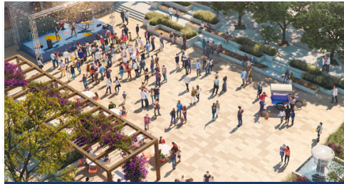
Public Square / Plaza for Civic Gathering