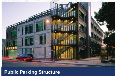
Public Parking Structure