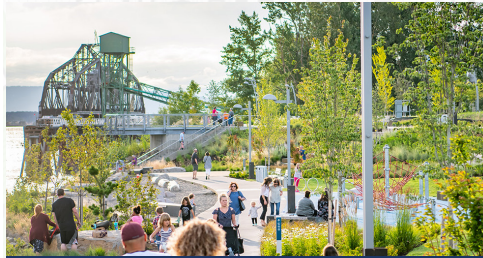
Active Trail Edges