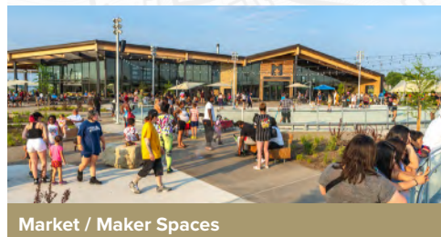
Market / Maker Spaces