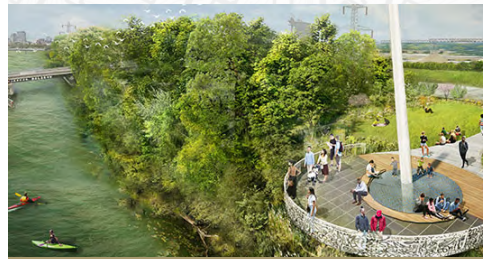
Trails with Viewing Platforms