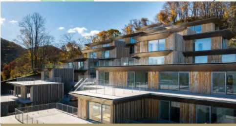
Terraced, Multi-Family Residential