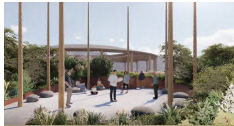
Tribal Specific Spaces