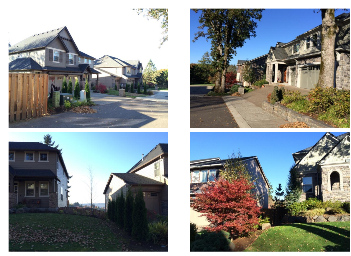
Rosemont Pointe - Examples of flag lots

Particularly on infill sites, there can be tight access and differences in scale and style between residences and neighboring properties. In addition to the Task Force recommendations, staff recommends provisions directing flag lot development, when possible, to mid block lanes, which would increase connectivity, and, as possible, orient houses to the lanes (see page 5 of the proposed amendments). Staff also recommends screening of the flag portion of the lot when it is near