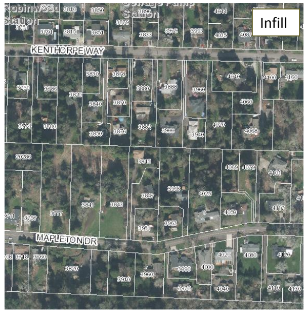
Mapleton & Kenthorpe