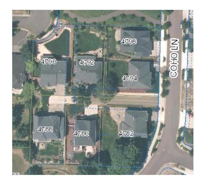
Rosemont Pointe - map and aerial view of flag lots