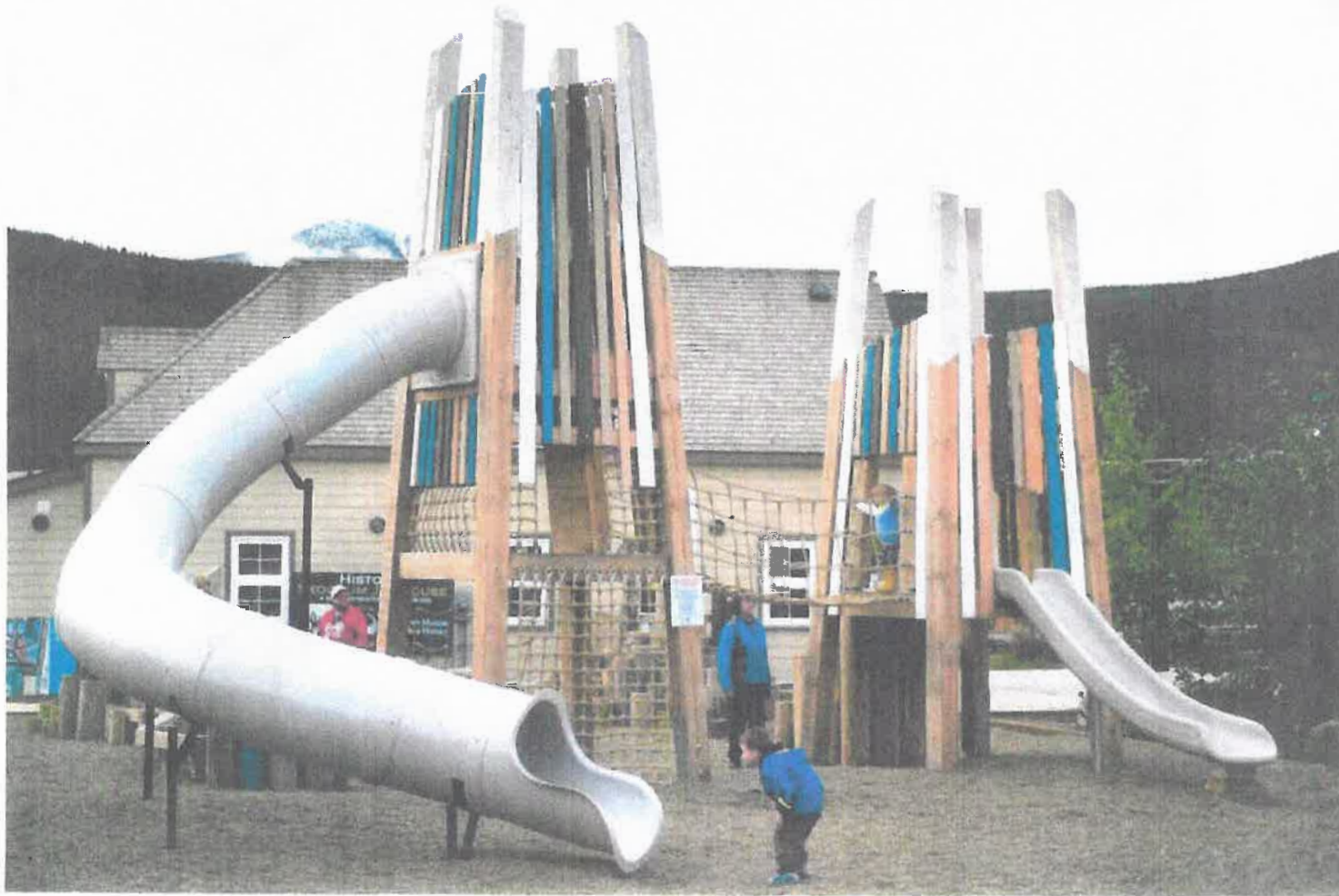
Landmark Tower - Example