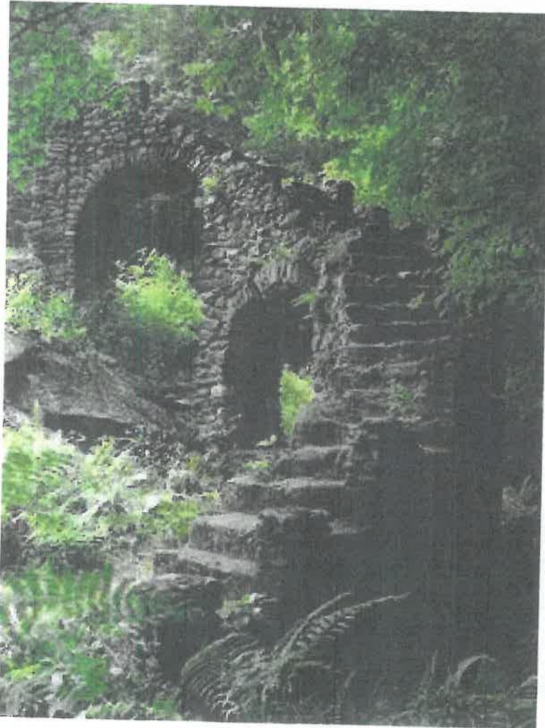
Stone Ruins - Example