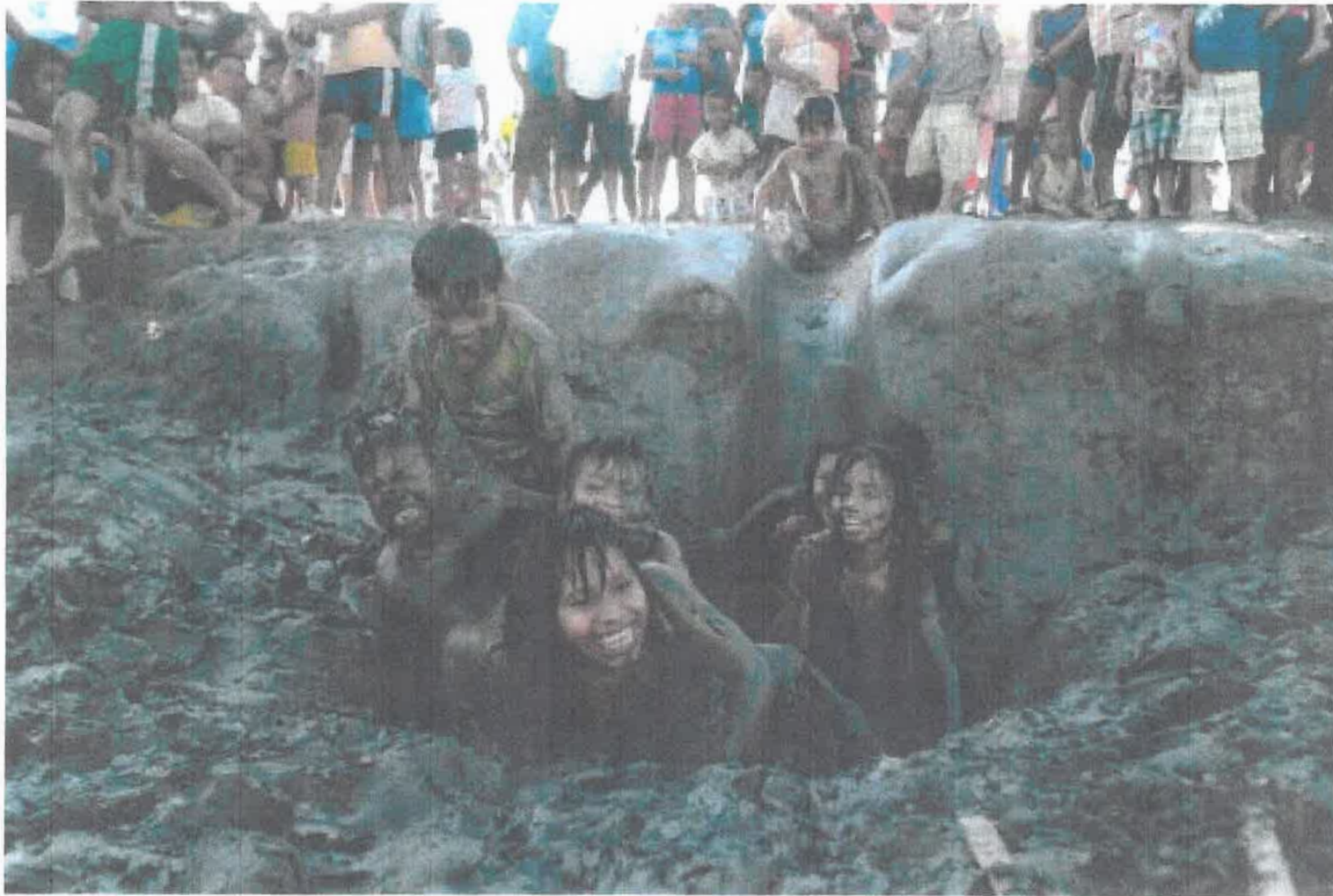
Mud Slide - Example