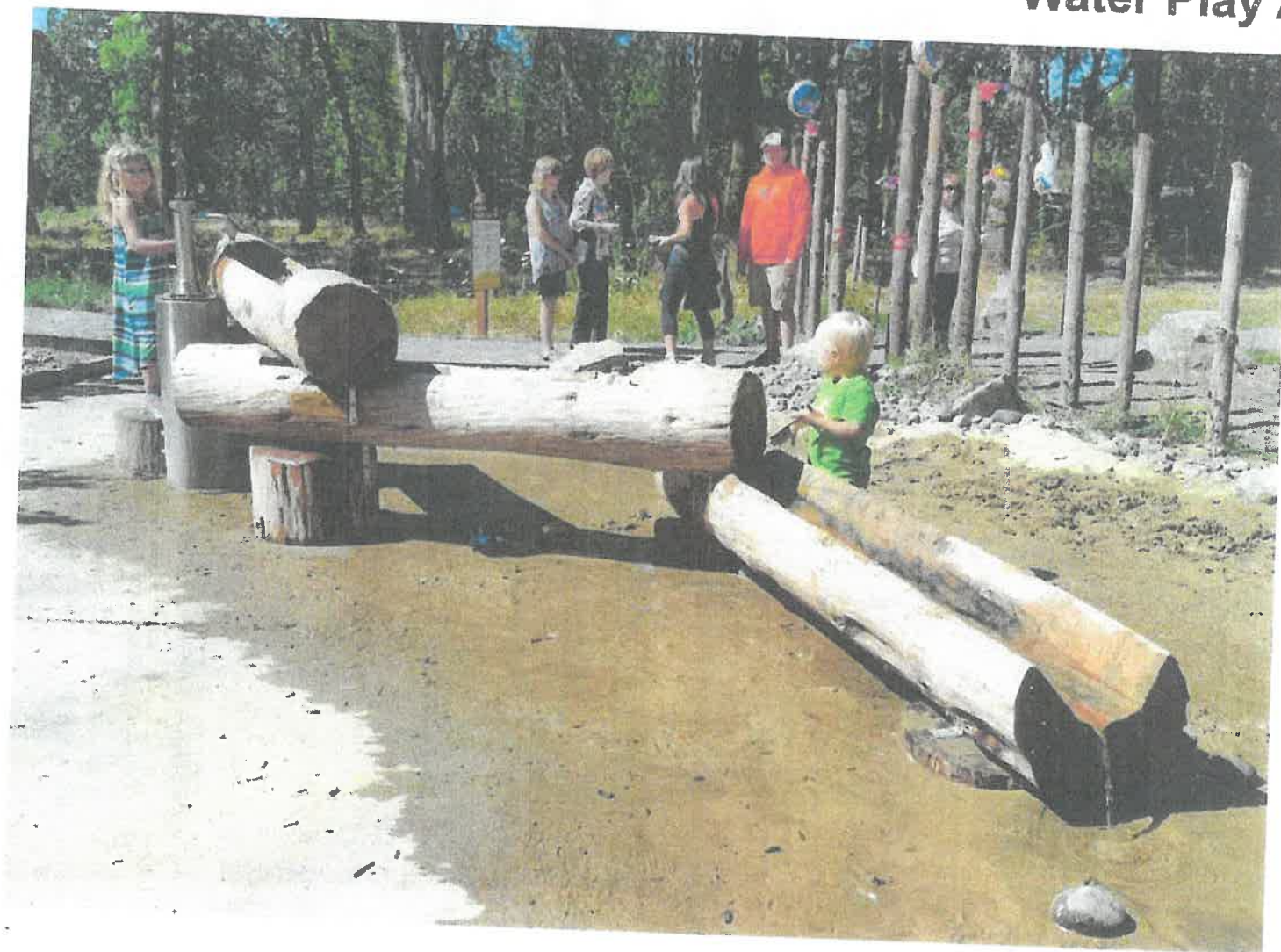
Water Pump and Raised Channel - Example