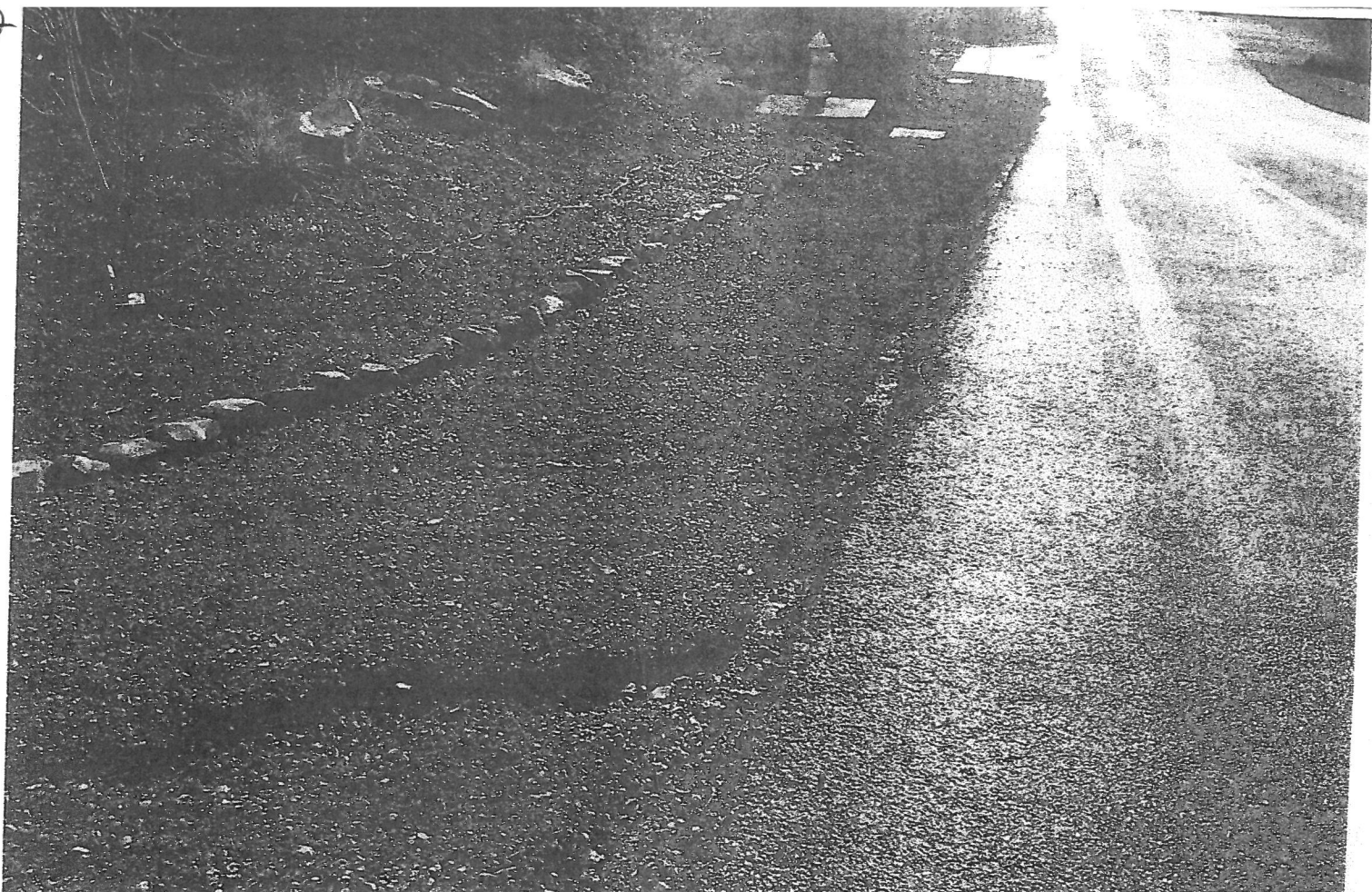
View of signposts from next to the curb

Propose the following Attachment 3- propose changes to subdivision