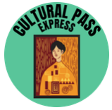
Use a Cultural Pass