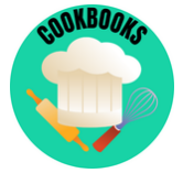
Cook from a Cookbook