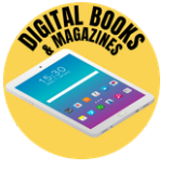
Use the Libby App