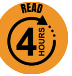
Read for 4 Hours