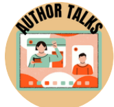
Watch a Online Author Talk