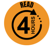
Read for 4 Hours

Complete four (4) activities in a straight or diagonal line to get a bingo in order to complete the challenge and earn a chance to win one of our grand prizes. Complete all sixteen (16) activities for another entry into our raffle. Don't forget, time spent listening to audiobooks and time reading to family members counts! Prizes can be collected beginning on July 9. See back for more information about Framing Our Future, Cultural Passes, Kanopy, Libby, Library Chef, and online author talks.