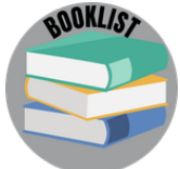
Read a Book from a Booklist