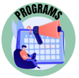
Enjoy a library program