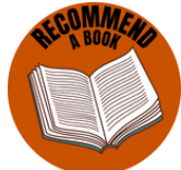
Recommend a Book