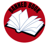
Read a Banned Book