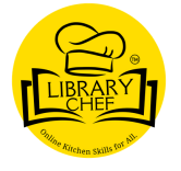
Use Library Chef