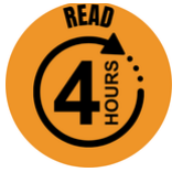
Read for 4 Hours