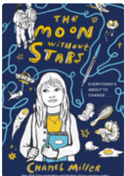
THE MOON WITHOUT STARS

Read-Alikes: Diary of a Wimpy Kid The Smartest Kid in the Universe