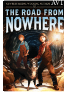
THE ROAD FROM NOWHERE Avi

Read-Alikes: Refugee Where the Mountain Meets the Moon