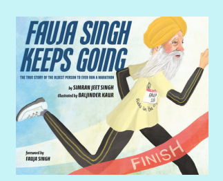
Fauja Singh Keeps Going: The True Story of the Oldest Person to Ever Run a Marathon