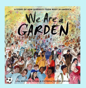
We Are A Garden

A cheerful exploration of the differences among people, including: skin color, ability, family structure, neurodiversity, celebrations, and language. End notes include information for grown-ups around inclusion, opportunity, and wellbeing.