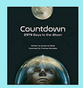
Countdown: 2979 Days to the Moon