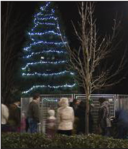
Community Tree Lighting December 6, 2013

The 12th Annual Community Tree Lighting will be at West Linn City Hall and Cascade Summit Town Square.