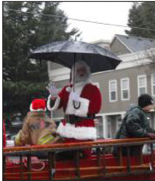
Holiday Parade December 14, 2013

There will also be photos with Santa, face painting, carolers, a holiday movie, and popcorn. Don't miss the treats, and in-store specials from the businesses of Cascade Summit Town Square.