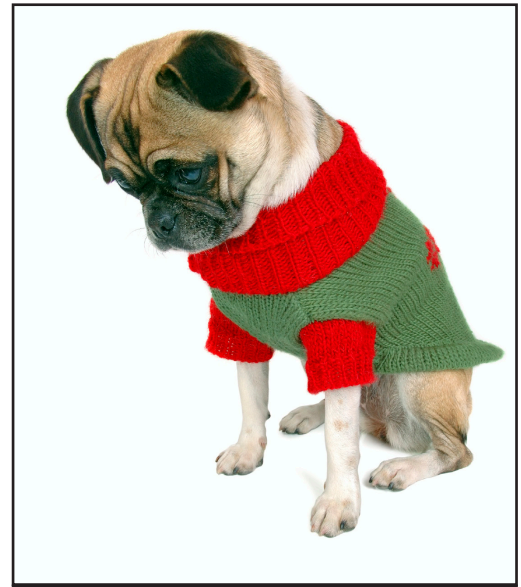
Ugly Holiday Sweater Dash December 14, 2013

Special thanks to: Tualatin Valley Fire & Rescue; Advantis Credit Union; Volunteers from the National Charity League; and Eventurous Events