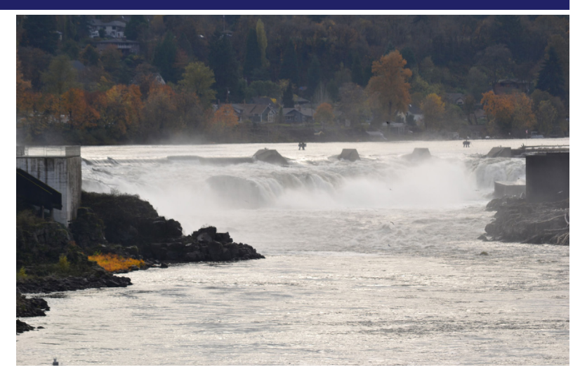
NOW: 2013 view of Willamette Falls.