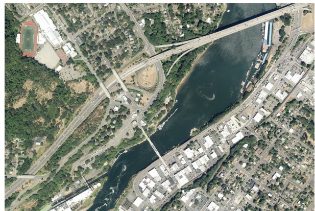
View above West Linn and Oregon City at the Willamette River.