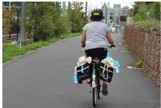
Biking on the Trolley Trail in Clackamas County.

The purpose of the Oregon City/West Linn Pedestrian and Bicycle Bridge Concept Plan is to identify potential bridge locations and provide opportunities for community and local agency conversations to reimagine a new crossing.