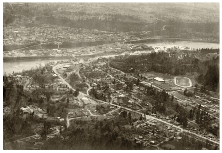
1960 Aerial view of the Bolton neighborhood and the Willamette Falls.