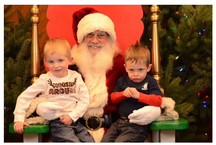
Santa made an appearance at this year's Holiday Tree Lighting.