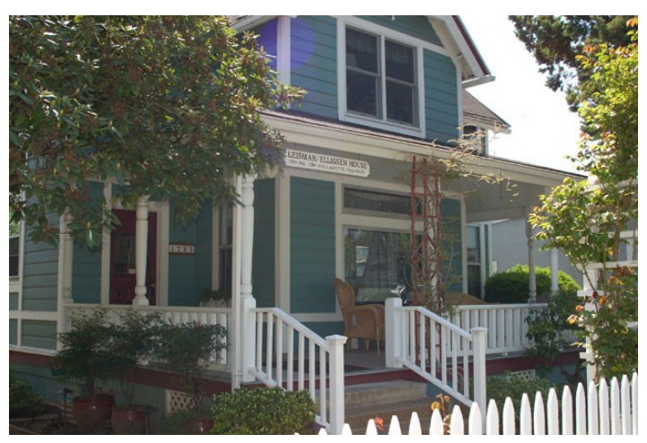
A home in the Historic Willamette District