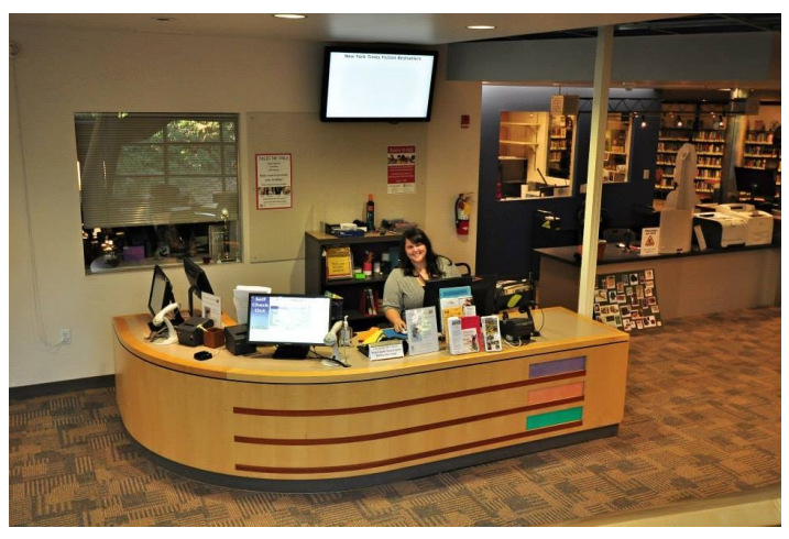
The remodeled check out desk

• The transition in Library Directors was the biggest challenge for the Board this year.