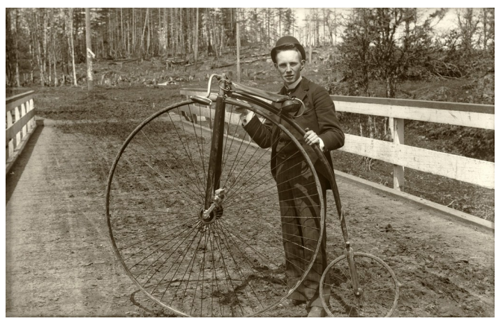
1895 photo of a high-wheeler bicycle on the West Linn end of the Oregon City suspension bridge.