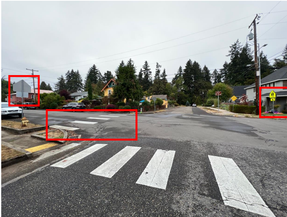
At Holmes Street and Buck Street, facing north (10/2022)