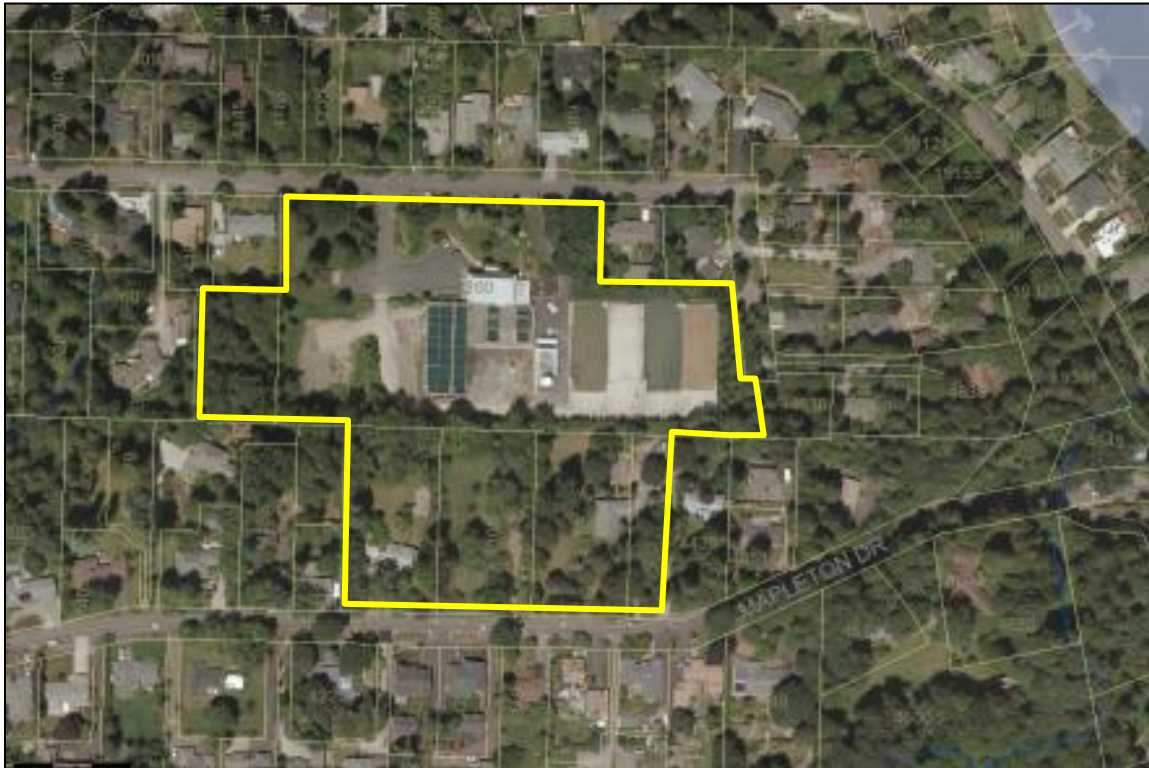
Figure 1 Subject Properties (proposed consolidation in yellow)

Following an unsuccessful initial bid process, the Applicant requested, and was granted, a one-year extension of their conditional use and design review approval through a decision by the Planning Director in MISC-97-28.