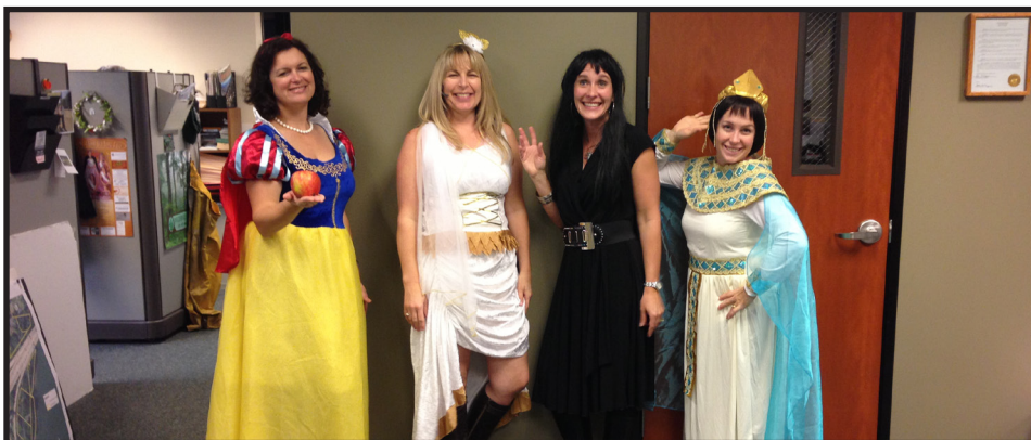
Don't forget to include City Hall in your Halloween trick-or-treat stops; our friendly Parks & Recreation staff will hand out candy until 5:00 p.m. on October 31.

Santa is the Grand Marshall each year at this community parade in the Historic Willamette District of West Linn. No entry fees charged. Candy permitted. To register in advance please visit WestLinnOregon.gov/ParksRec . Parade check-in and staging begins at 10th Street & Willamette Falls Drive.