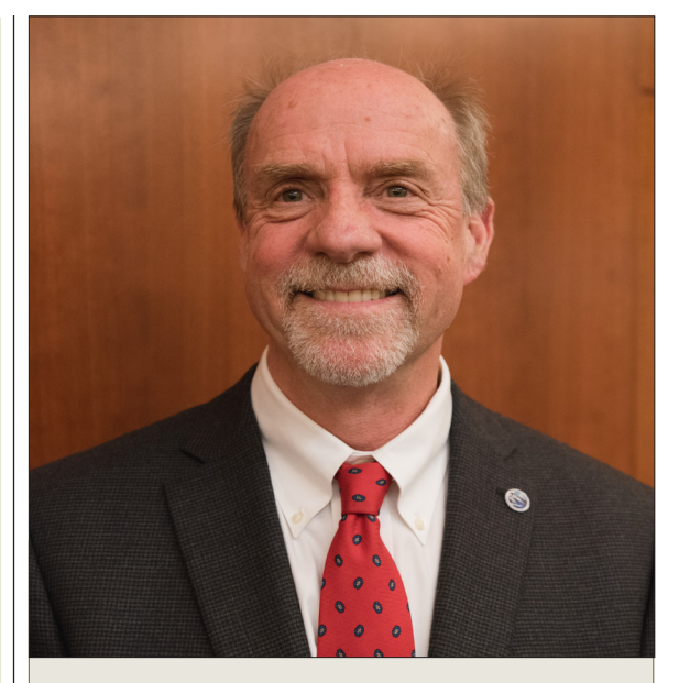
A Moment with Mayor Russell B. Axelrod

Following the tree lighting families were invited to decorate cookies and ornaments, have their face painted and visit with Santa.